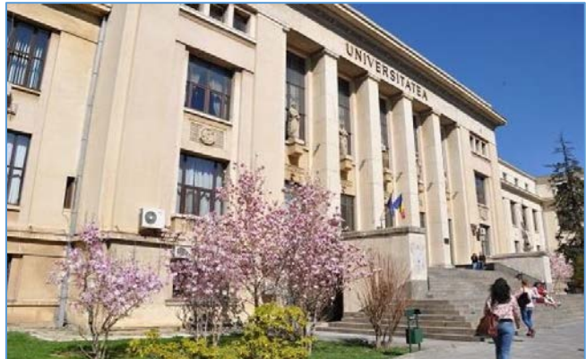
Entrance to the Faculty of Law

The application deadline for bachelor's and master's students for stays in the following academic year is always 1 December . Erasmus+ means students pay no tuition fees at the foreign university. In addition, a monthly grant of €330 is awarded for your stay in Romania. You will find more information on financing here on our website .