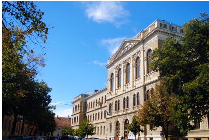
Entrance of the university

If we have piqued your interest, we encourage you to watch the video of Babeş-Bolyai University Cluj-Napoca. You will find more information here in our Publisher . The following link will take you to the university's website.