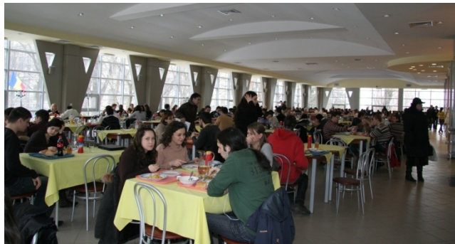
Alexandru Ioan Cuza' University's dining hall