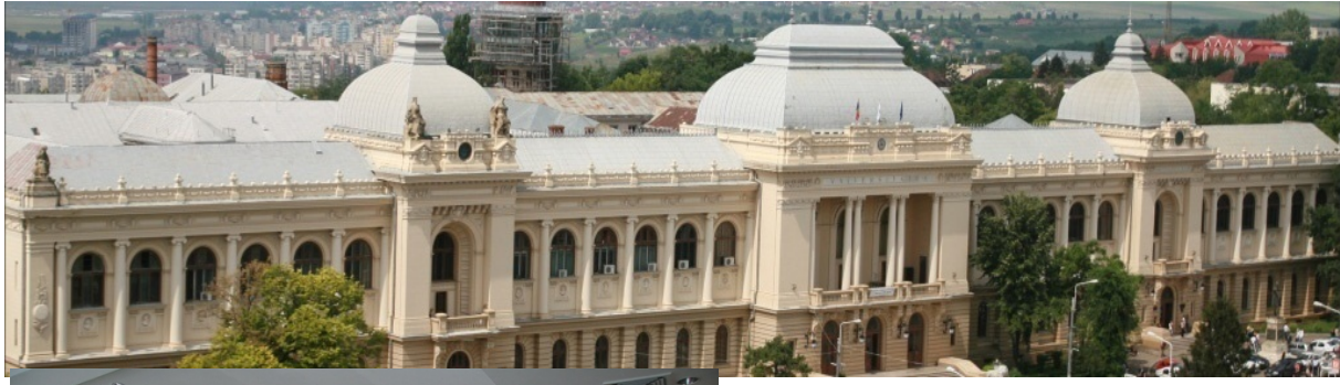
Entrance of the university

If you are interested, please watch the university's video for international students. You will find more information here in our Publisher . The following link will take you to the university's website.