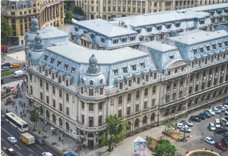
Faculty of Geography