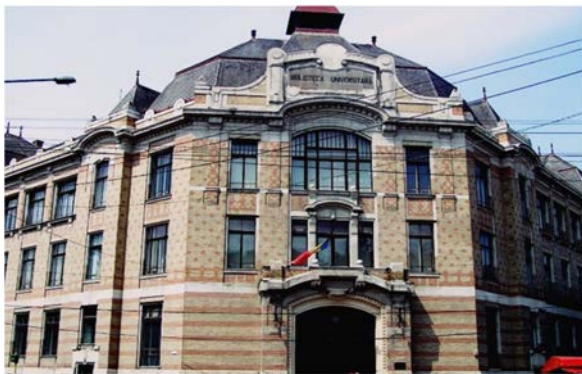
Central Library of Babeş-Bolyai University Cluj-Napoca