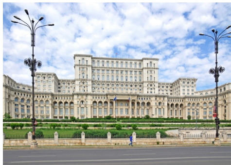
Palace of the Parliament in Bucharest

Herestrau Park is the largest and oldest park in Bucharest (17 hectares), providing a leafy oasis in the middle of the city. Bucharest is known above all for its versatility and the contrasts between the traditional and the modern, the young and the old, and the poor and the rich.