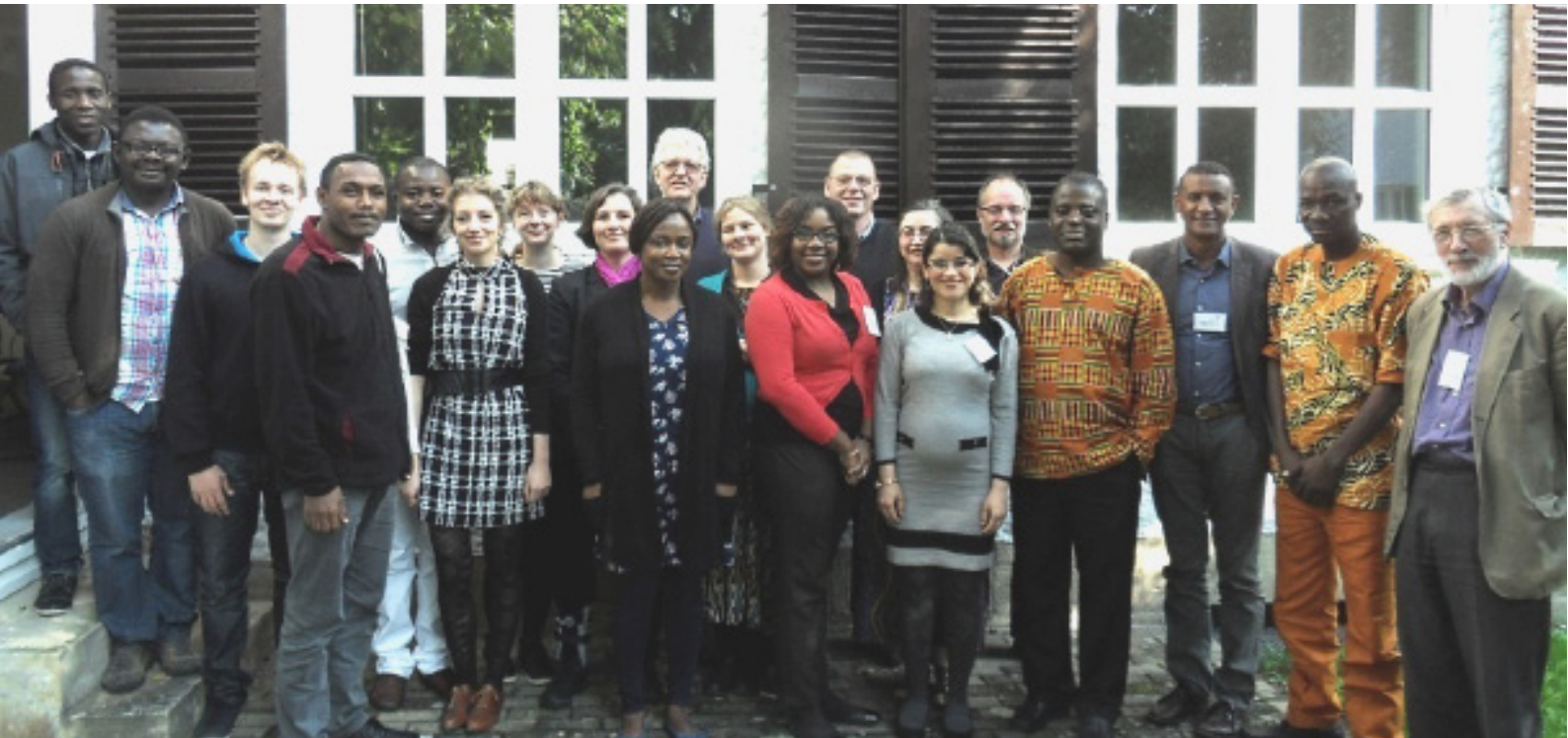
Participants of the international conference

Even 100 years after the outbreak of the 1st World War, historical views of the events remain very euro-centric in nature. The grave consequences of the war in other parts of the world are rarely mentioned, and particularly not those of African countries, still viewed as “exotic” theatres of war on the rim of the central movements of power and of little interest except for their colonial history. A new conference held in Bayreuth in October 2014 aimed to address this imbalance, with scholars representing Africa, Europe and North America.