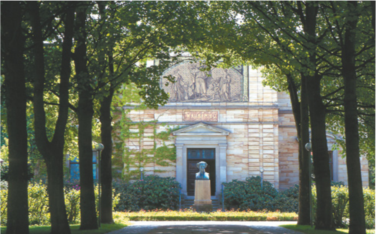
Wagner's home Haus Wahnfried in Bayreuth. Due to its close ties to NS propaganda, the house was partially destroyed during WWII. Today it houses the Richard Wagner museum.

As 2013 marks the 200 th birthday of Richard Wagner, the City and University of Bayreuth are exploring the composer's controversial heritage with a series of concerts, talks and exhibitions.